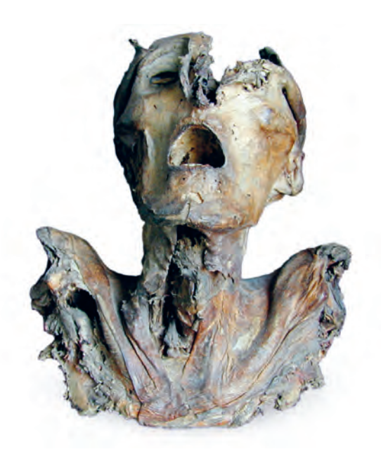
\scriptstyle\rm I. The head and shoulders of a cadaver, sold on the antiquities market in 2003.