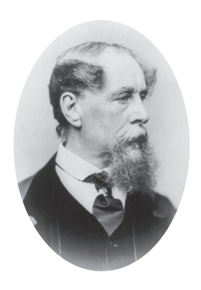
Charles Dickens (1812–70)