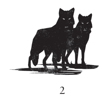
Jonathan Harker's Journal (continued)

5 TH MAY – I must have been asleep, for certainly if I had been fully awake I must have noticed the approach to such a remarkable place. In the gloom the courtyard looked of considerable size, and as several dark ways led from it under great round arches, it perhaps seemed bigger than it really is. I have not yet been able to see it by daylight.