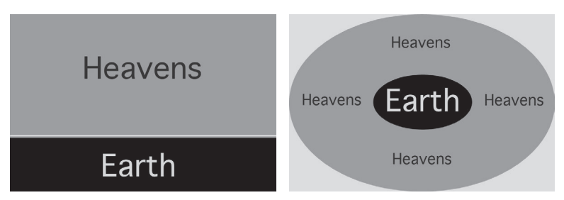
Figure 1a, left. Most early human civilizations viewed the world as the Heavens above and the Earth below. Figure 1b, right. The ancient Greeks saw the Earth as a stone floating in space.