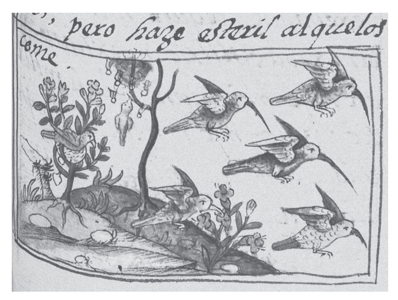
I. An illustration of hummingbirds from the Florentine Codex (1578). Note the hummingbird hanging from the tree in a state of 'torpor'.

The Florentine Codex listed hundreds of New World plants, all divided according to an Aztec system of taxonomy. The Aztecs typically arranged plants into four broad groups: edible, decorative, economic, and medicinal. These divisions were reflected in the naming of plants: for example, plants ending with the suffix -patli were medicinal, whereas those ending with the suffix -xochitl were decorative. This organization was then reproduced in the Florentine Codex. All the medicinal plants are listed together, with names such as iztac patli (a herb that could be used as a cure for fever). These are then followed by all the flowering plants, with names such as cacaloxochitl (known in Europe as the frangipani, after a sixteenth-century Italian noble who imported it). 23