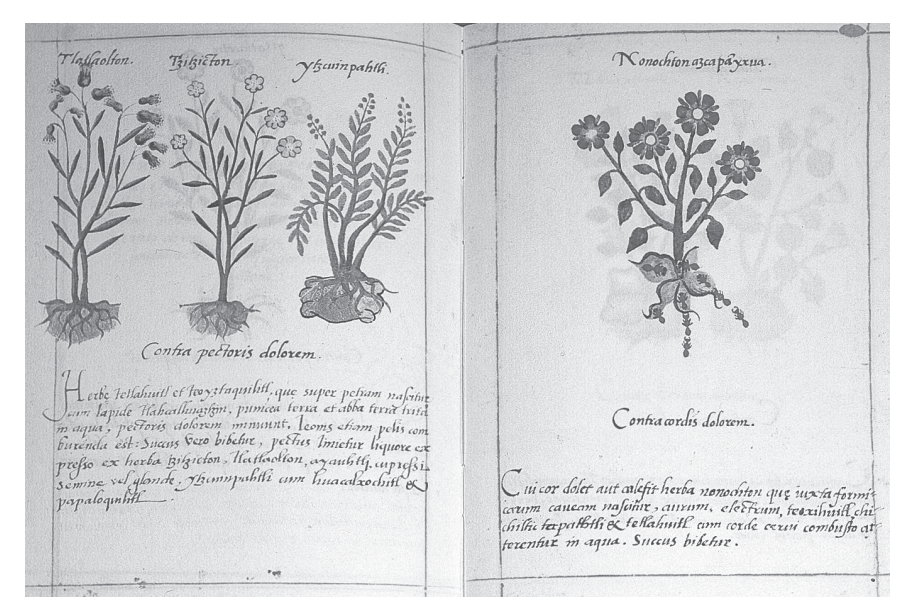
3. An illustration from Martín de la Cruz, The Little Book of the Medicinal Herbs of the Indians (1552). The roots on the plant named itzquin-patli ( third from left ) feature the Nahuatl glyph for 'stone'.

The final clue to Aztec influence is the most important, but also the most difficult to spot. Earlier historians often read Cruz's illustrations as imitations of typical European botanical drawings, with each plant pictured in isolation, roots and leaves visible for easy identification. More