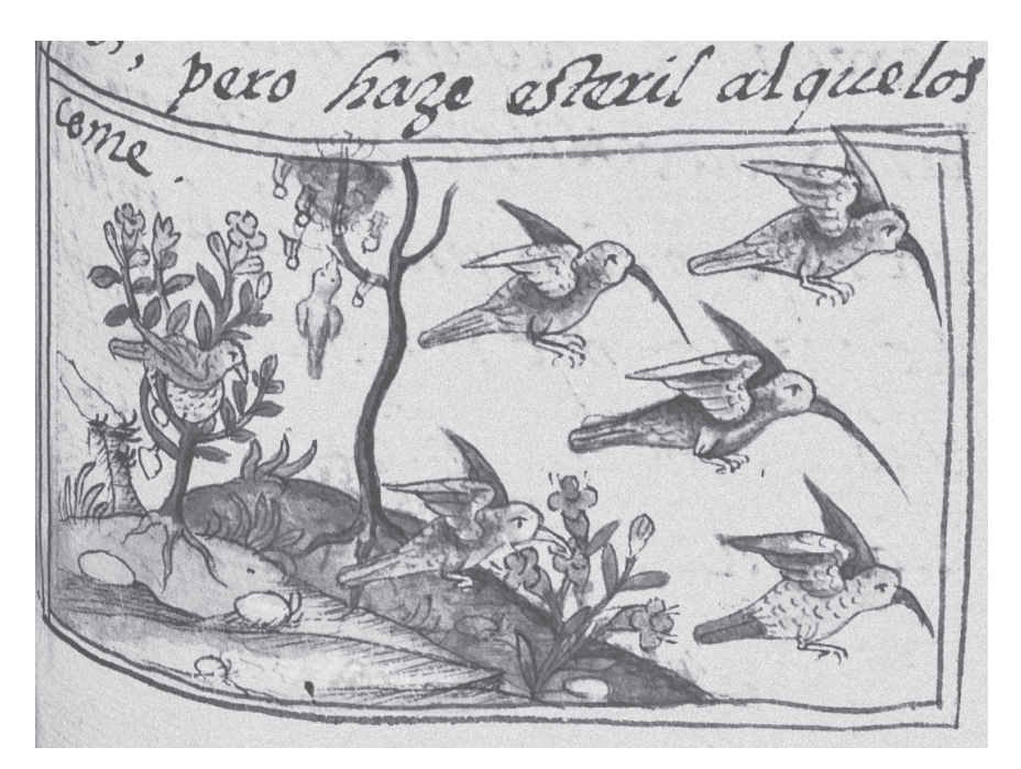
1. An illustration of hummingbirds from the Florentine Codex (1578). Note the hummingbird hanging from the tree in a state of 'torpor'.

The Florentine Codex listed hundreds of New World plants, all divided according to an Aztec system of taxonomy. The Aztecs typically arranged plants into four broad groups: edible, decorative, economic, and medicinal. These divisions were reflected in the naming of plants: for example, plants ending with the suffix -patli were medicinal, whereas those ending with the suffix -xochitl were decorative. This organization was then reproduced in the Florentine Codex . All the medicinal plants are listed together, with names such as iztac patli (a herb that could be used as a cure for fever). These are then followed by all the flowering plants, with names such as cacaloxochitl (known in Europe as the frangipani, after a sixteenth-century Italian noble who imported it).<sup>23</sup>