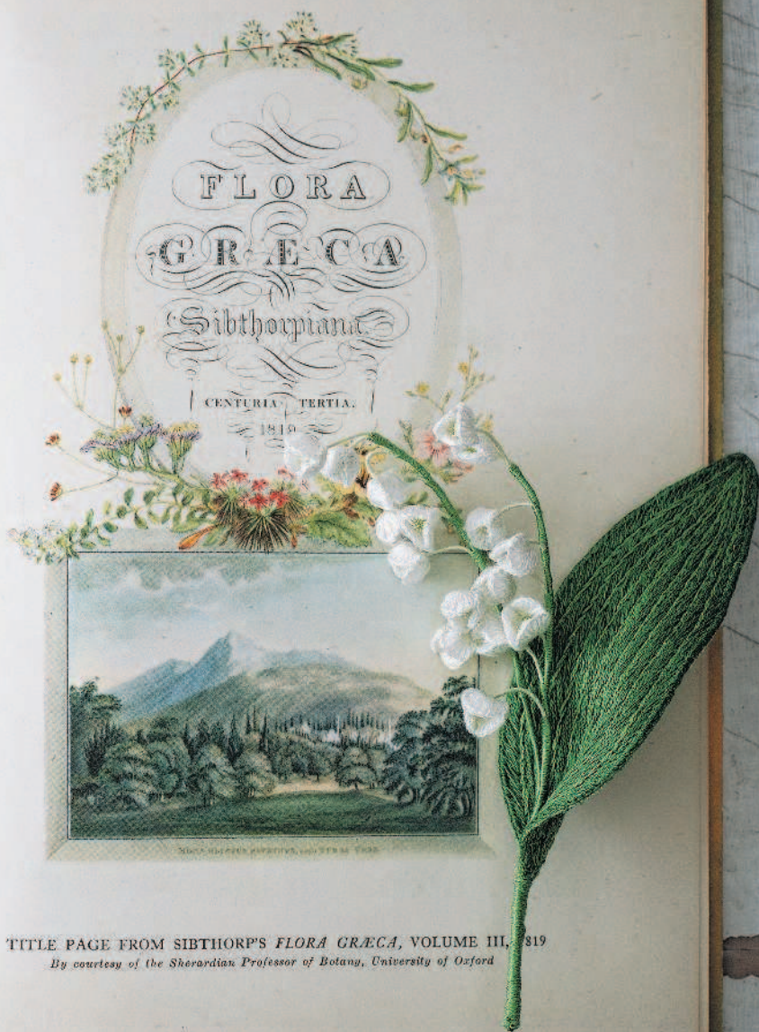
TITLE PAGE FROM SIBTHORP'S FLORA GRAECA, VOLUME III, 1819

Давайте попробуем оживить милый образ звенящего ландыша с поникшими колокольчиками. 1 мая во Франции — День ландыша. Говорят, что в этот день французы по традиции дарят любимым ландыши.