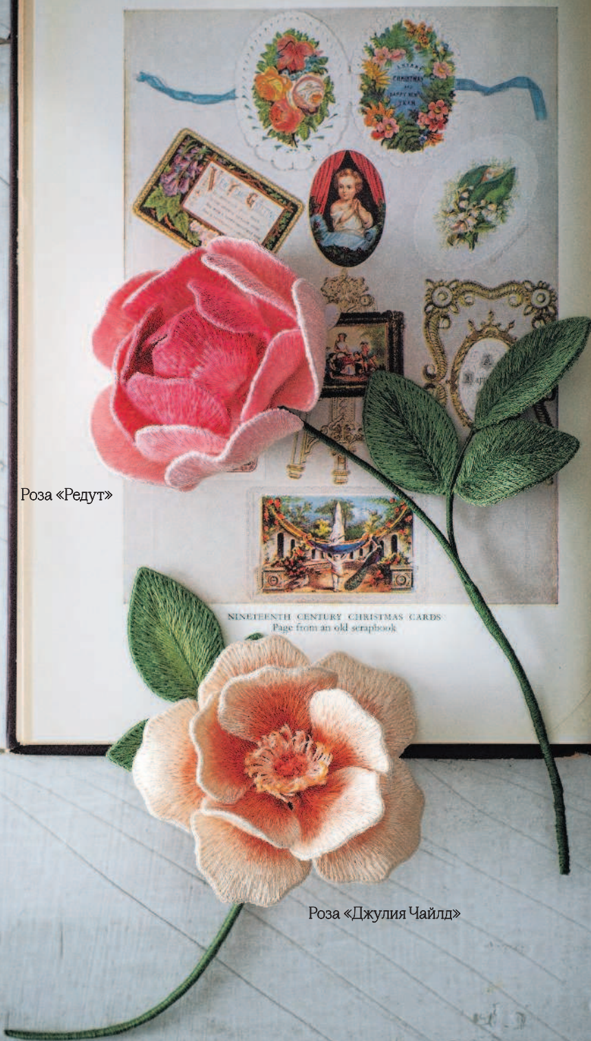
Роза «Джулия Чайлд»

На выполнение вышивки розы «Редут» нас вдохновили изысканные картины цветов, нарисованные популярным художником XVIII века Пьер-Жозефом Редуте.