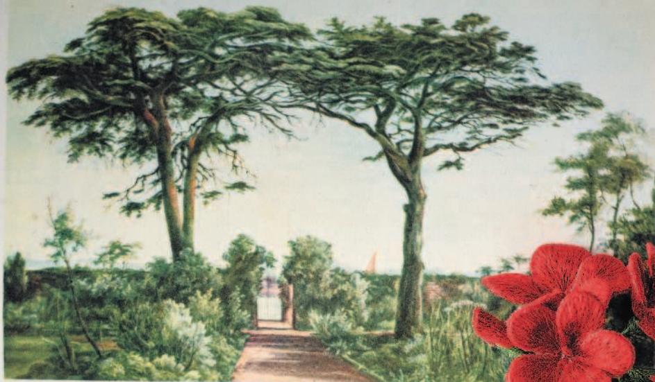
STUDY FROM NATURE OF THE CEDARS IN THE GARDENS OF THE APOTHECARIES COMPANY, LONDON, ENGLAND Water colour by J. W. Fuge, c. 1830