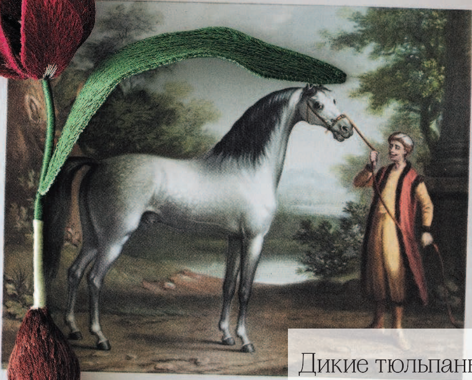
GREY ARAB STALLION From the original oil painting by John Wootton, c. 1657-1765